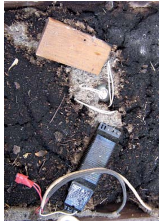
Fire damage caused by down light covered by loose fill insulation

Clause 4.5.2 of AS/NZS 3000:2007 provides clear information in relation to lighting equipment near thermal insulating materials and the minimum clearances required.