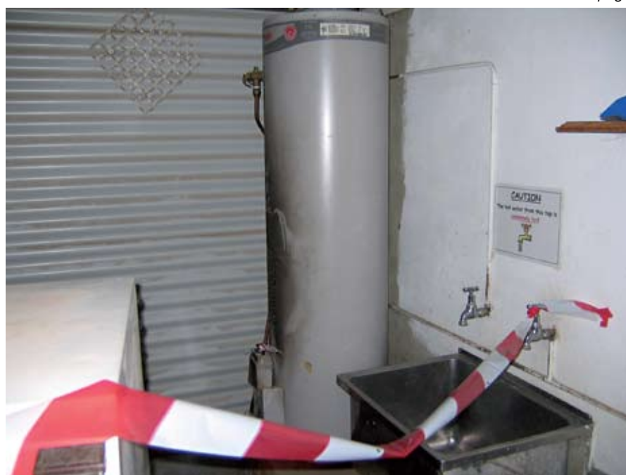
Fire damage to the water heater