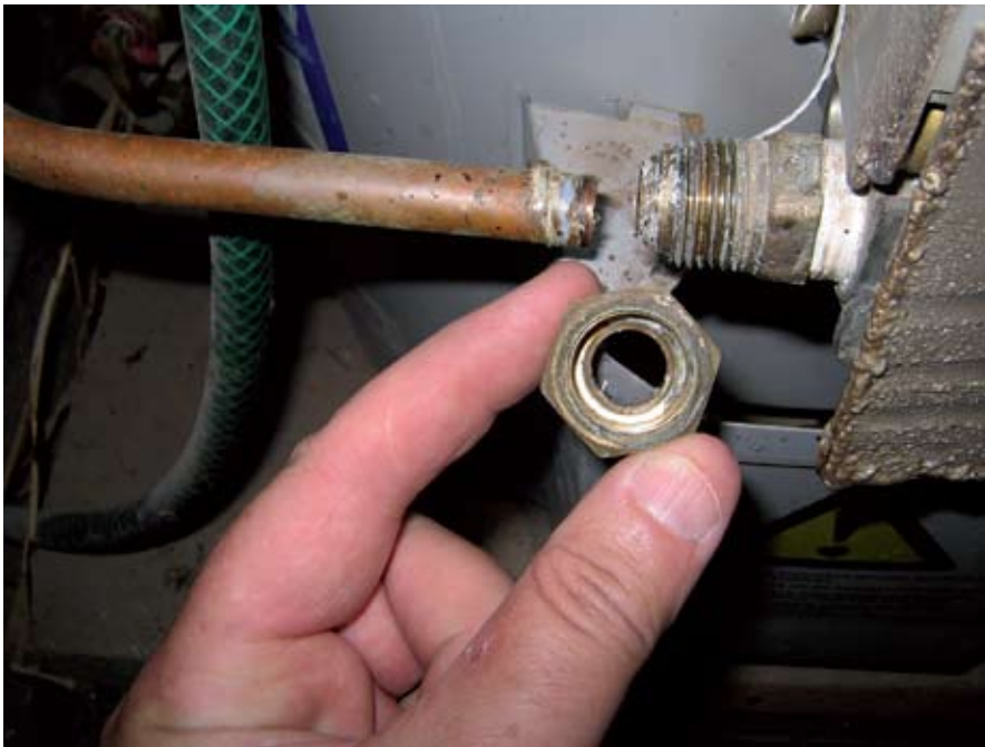
Non compliant and dangerous connection to the appliance