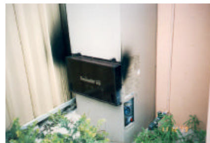
Water heater with damage around flue terminal

This incident highlights the importance of ensuring sufficient clearances between appliances and neighbouring structures, as detailed in the Gas Installation Code AG 601-1998 and manufacturers' installation instructions.