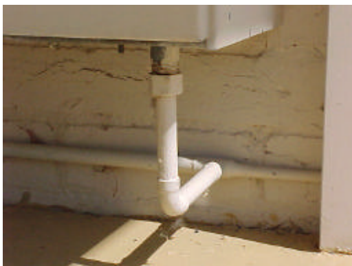
Olive type fitting on service apparatus

In practical terms, this variation permits olive type fittings to be used only for connecting consumers' gas installations to gas undertakers' service apparatus.